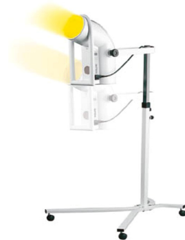
BIOPTRON 2 with Y Stand

Authorised UK Distributors & Service Agents D & R MARKETING LTD, Concorde Business Centre, Teesside TS18 3RB Tel: 01642 612512 therapy@drmarketingltd.co.uk Website Address: advancedlighttherapyuk.com