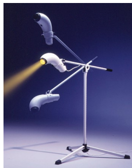
BIOPTRON Compact III with Tripod Stand

BIOPTRON Colour Therapy is a holistic addition to the BIOPTRON Compact III medical light therapy system. Different sized lenses are designed to fit either the BIOPTRON Compact III or Biopton Pro 1 lamps. Twelve simple-to-follow treatment schedules offer alternative / holistic methods of treatment in the area of well-being and beauty.