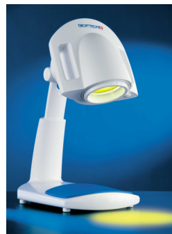
BIOPTRON Pro 1 with Table Stand